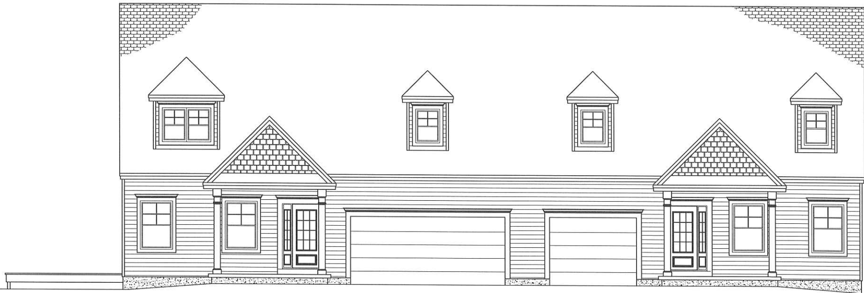
○ FRONT ELEVATION N.T.S. 2023.00 SQUARE FOOTAGE TWO CAR GARAGE